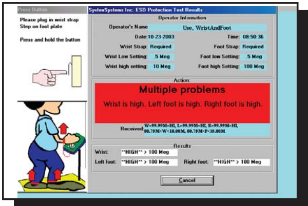
Sample test data screen