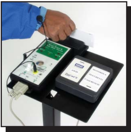
Scan using keyboard, bar code, or mag stripe, HID, CASI-RUSCO, MOTOROLA, or AWID proximity reader.