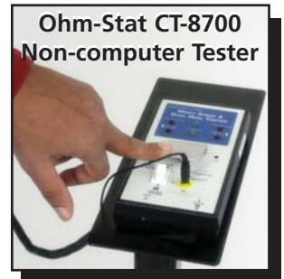
Adjustable limits. Test each foot and wrist individually and simultaneously

When used with a computer and leading edge software the employee's test results are stored in the computer and then can be emailed to supervisors. NO MORE LOG BOOKS. These reports and data can help conform your company to 20/20 specifications or ISO conformance. Speed up testing, and eliminate no tests.