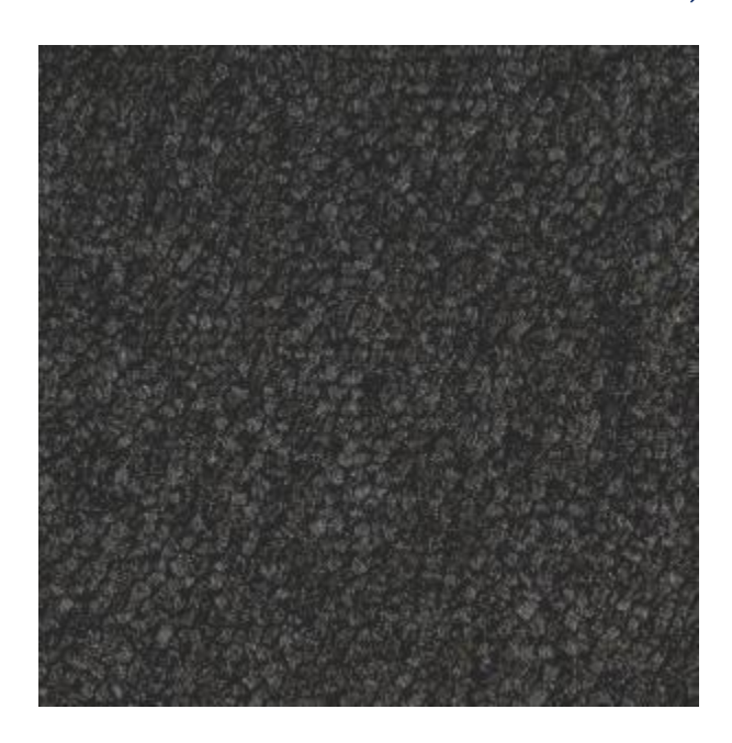
4175 - Volta

Powerful Performance, Permanent Static Control