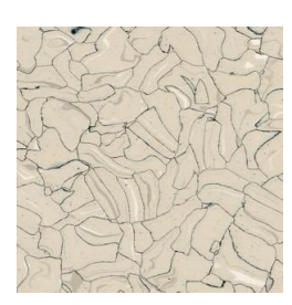
150213 | sahara