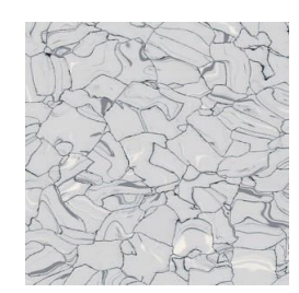
150205 | adula