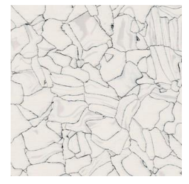
150201 | everest