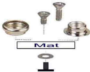
Figure 1, attachment of ground lug to mat

Note: we have predrilled holes in all 4 corners of the structure to accommodate these fasteners but they may be relocated to any place convenient to an AC electrical outlet. Drill first using 1/8" bit.