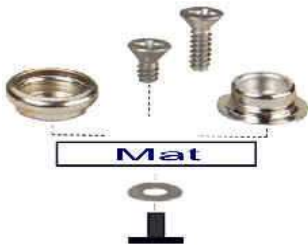
Figure 1, attachment of ground lug to mat

Note: we have predrilled holes in all 4 corners of the structure to accommodate these fasteners but they may be relocated to any place convenient to an AC electrical outlet. Drill first using 1/8" bit.